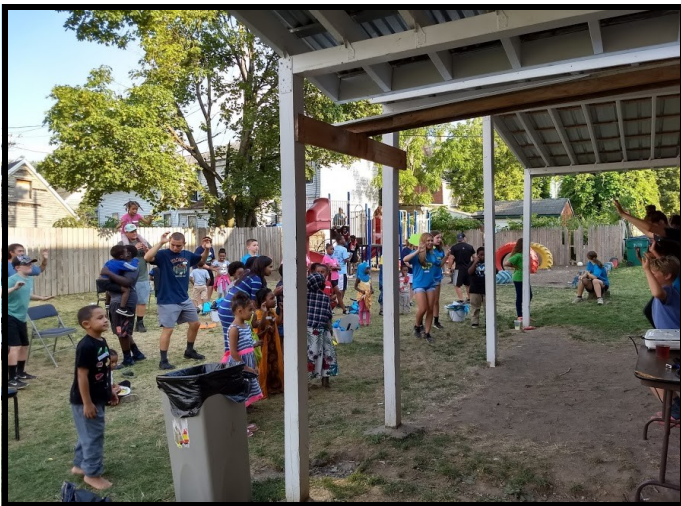
Vacation Bible School at Grace Community Church, in collaboration with Eastern Hills Wesleyan Church! Thank you, friends!