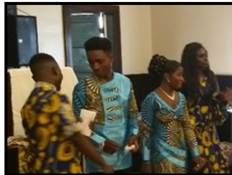
First Wedding at Mission of Christ Church (above) and baptismal service with Ashwood Wesleyan at Lake Ontario (below)