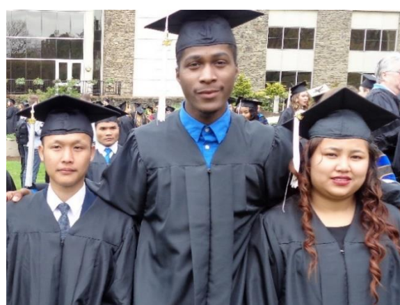
Houghton College Graduation May 13, 2017